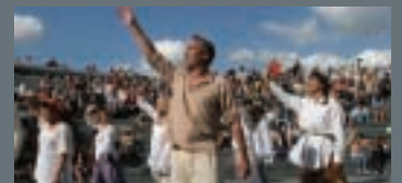
Theatre suitable for all ages at the Scoop.