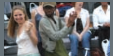
Dancing to The AllStars at the Scoop at More London in 2005.

Get closer to some of your favourite musicians at one of the Scoop at More London's friendly free concerts during More Music. Each Tuesday to Friday in July there will be lunchtime and evening concerts for you to experience a huge variety of music. From gospel to Latin, rock to pop, big band to R&B, and jazz to funk, there will be something to tempt all tastes and the odd well-known name appearing on the line-up. Bring some friends and a picnic and enjoy some spine-tingling music in the relaxed riverside atmosphere.