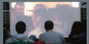
Enjoying Quadrophonia during More Movies 2005.

Watch out also for a new photographic 'exhibition', the Mayor of London's Big Dance, storytelling, and the Thames Festival.