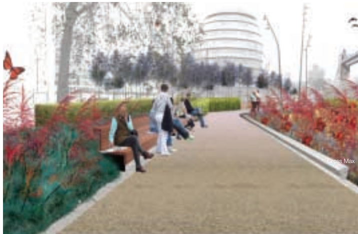
Entering the transformed Potters Fields Park from Tooley Street.