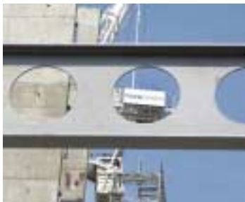
Cores of plots 3 and 4.

Construction work continues at More London with all three phases of work making good progress. In addition the Unicorn Theatre has unveiled its presence to Tooley Street and is scheduled to complete towards the end of the year.