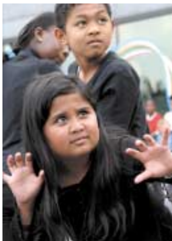
Watch out Hercules!

On the 11 July, More London was delighted to host the finale of Southwark Council's second STEP festival. STEP, which stands for Southwark Theatres' Education Partnership, is led by Southwark Council's Arts and Culture Service to highlight the vast range of imaginative and creative education work that goes on in the borough. Working with Tower Bridge, Townsend, Albion, Oliver Goldsmiths and Charles Dickens primary schools, The Steam Industry took part in STEP Out! a programme of special commissions staged in outdoor venues that take schools on an exciting journey through open-air performance.