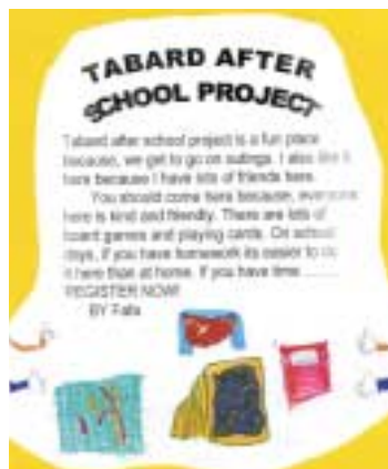
Art work done by one of the children supported by the Tabard project.

More London's support has helped the project to purchase new games, stationery, art and other materials.