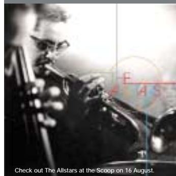
Check out The Allstars at the Scoop on 16 August.

For the full line-up visit www.morelondon.com/thescoop or call 020 7403 4866.