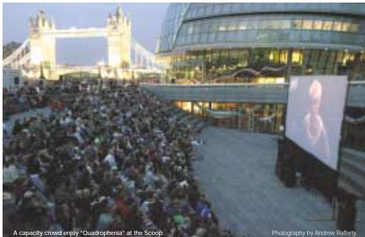
A capacity crowd enjoy "Quadrophenia" at the Scoop.

The overwhelming response from the audience was extremely positive and there have been numerous requests to extend the season further into the summer. There isn't space in the programme to extend this year, however, the free film season will return to the Scoop next summer.