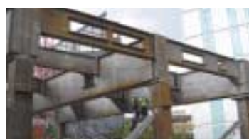
The steel transfer structure for the hotel function room.

The main steel transfer structure creating the hotel function room was successfully installed over a weekend in mid-May. The structure forms a space capable of holding a banquet for 275 people or a 400-person conference, whilst supporting the ten floors of bedrooms above. Some of the steel beams weighed over 40 tonnes and required the largest mobile crane in the country to lift them into position. The remaining superstructure will continue to rise above the hoarding reaching the same height as the Ernst & Young building, which has recently won the Large Commercial category of the Built in Quality Awards 2005.