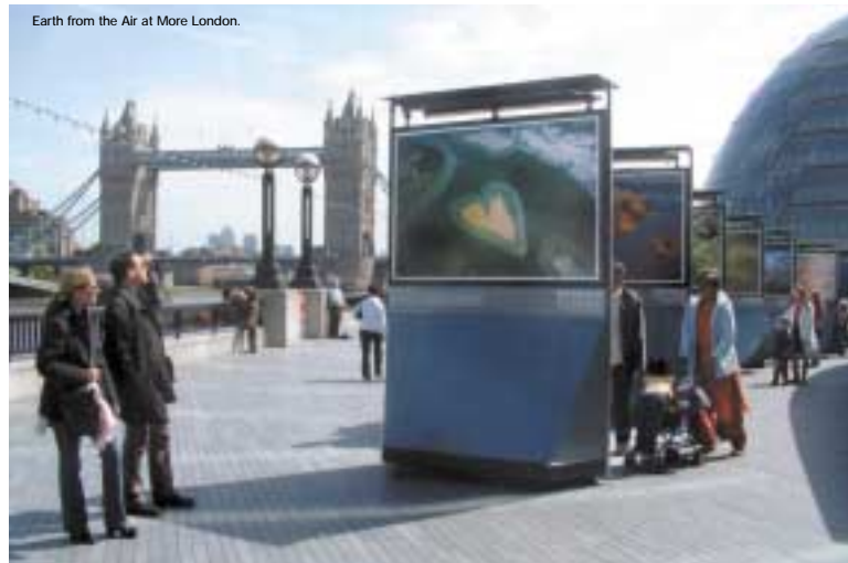
Earth from the Air at More London.

The free outdoor exhibition of over 120 large scale aerial photographs continues to be a huge success, attracting fresh audiences to More London Riverside both day and night, a perfect compliment to the Scoop's summer events programme. Earth from the Air has also attracted a number of schools, being an inspirational cross-curriculum learning resource for pupils of all ages. The exhibition continues until December 2005.